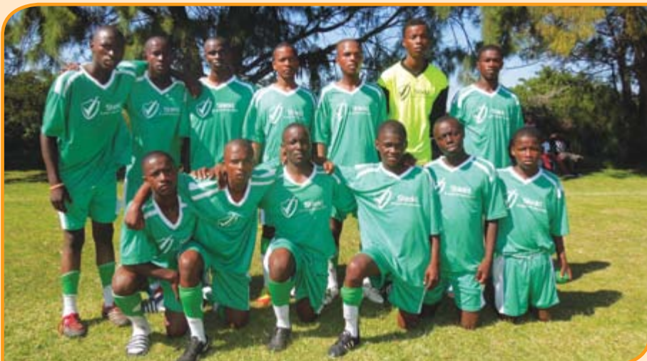
FUTURE SOCCER STARS... Having something to do after school is a great thing to experience.

It is clear that there are a lot of activities to take part in at Walmer High School. There is only one way you can run away from your problems and that is to take part in these extramural activities.