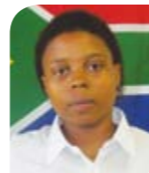
By: Thoz Mbongolo

There you have it, students, teachers, and residents of Walmer. The teachers have spoken and now it is up to you and the arm of law to take action.