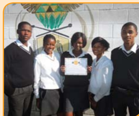
BACK AGAIN... The debate club is back again at Walmer High School!