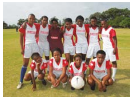
GLAMOUR GIRLS... Walmer High's Girls' Soccer team takes time to pause for a photo. Sport is very good for us young teenagers. It keeps us focused most of the time.